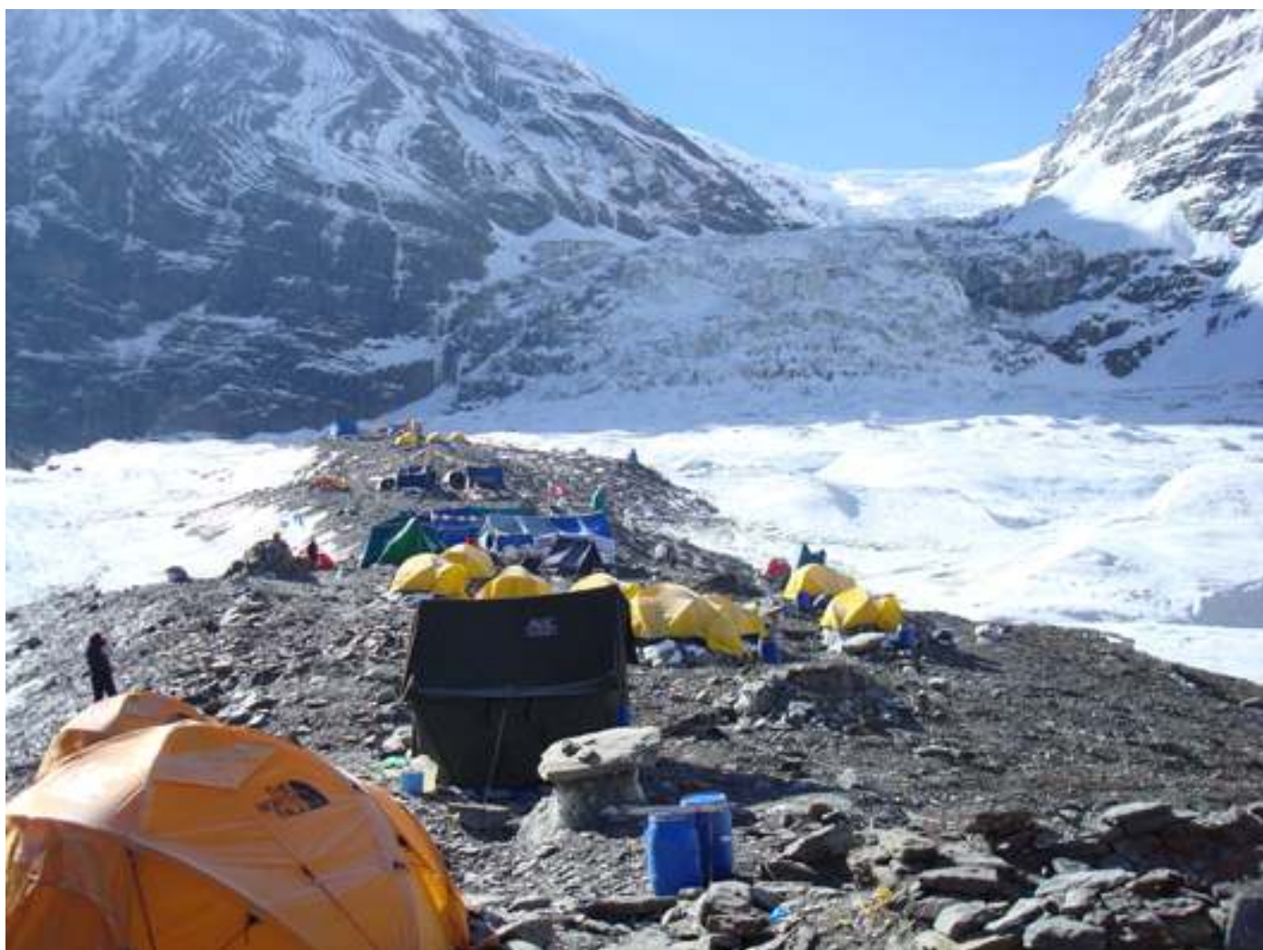
Dhaulagiri Base Camp