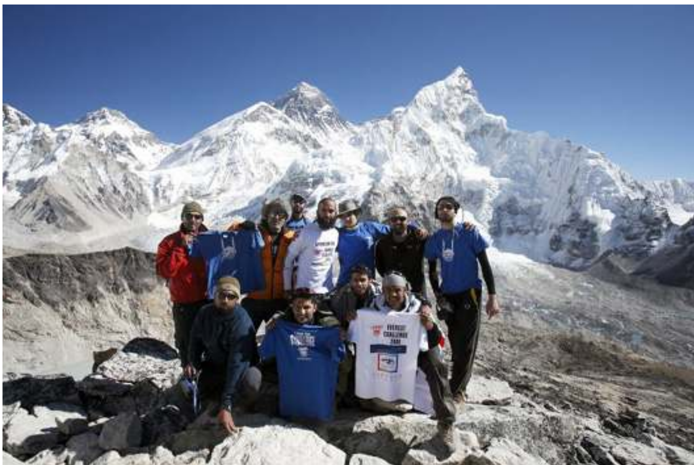
Group at Kalapatar with Mount Everest and Mount Nuptse behind