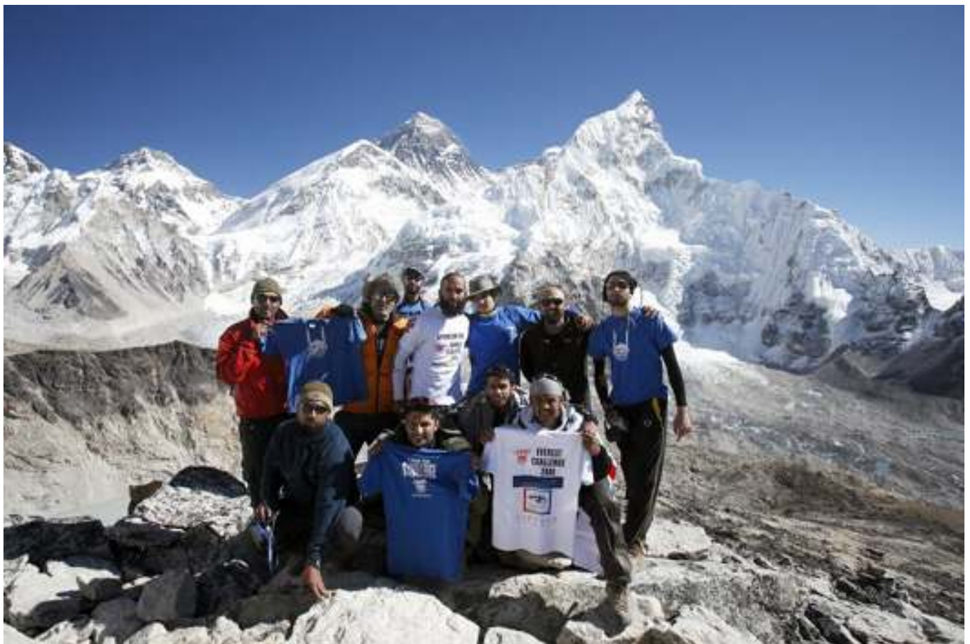
Group at Kalapatar with Mount Everest and Mount Nuptse behind