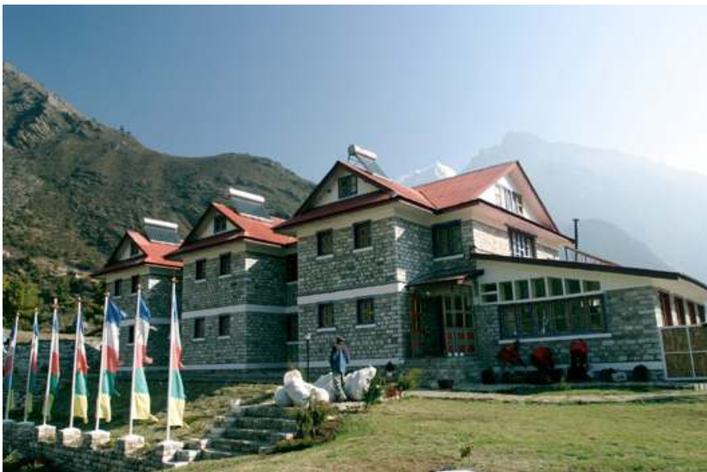
Everest Lodge at Tashinga