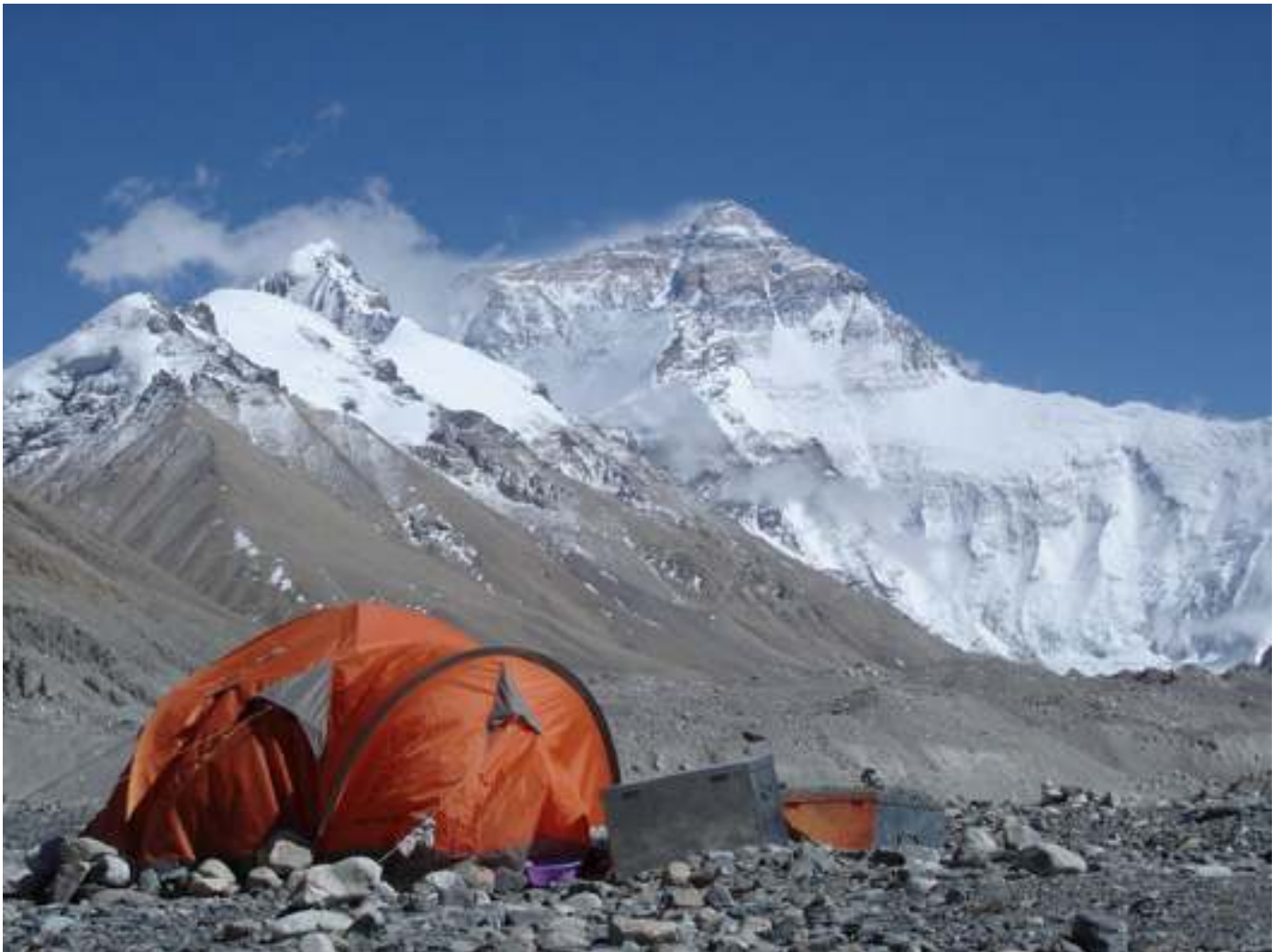
Mount Everest seen from Northside Base Camp in Tibet