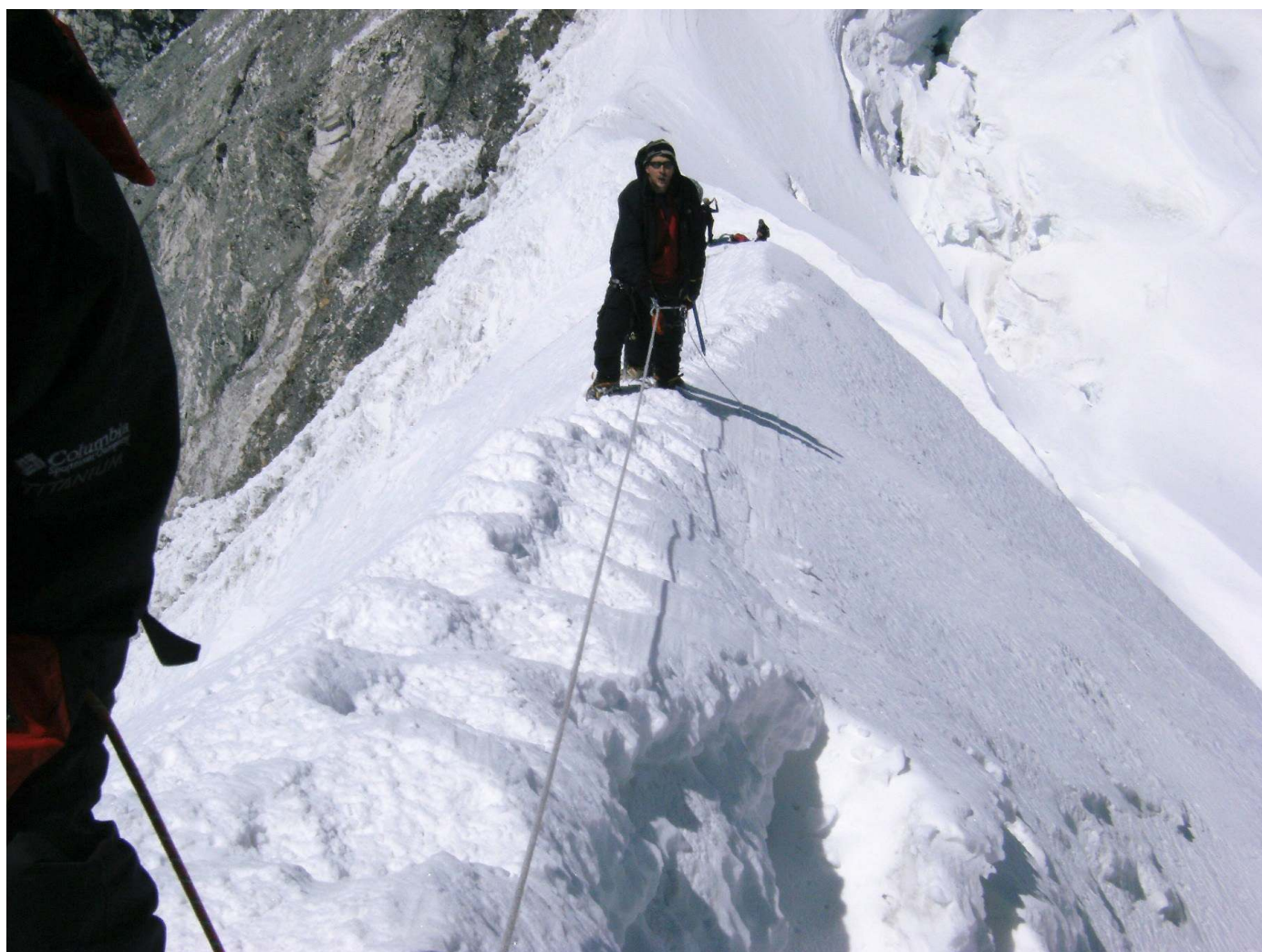
Climbing the summit ridge to the summit of Island Peak