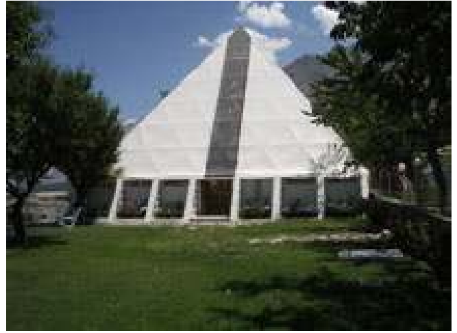
Italian K2 museum at K2 Motel

Day 4. Drive to Skardu on KKH (if flew on Day 2 then this is buffer day).