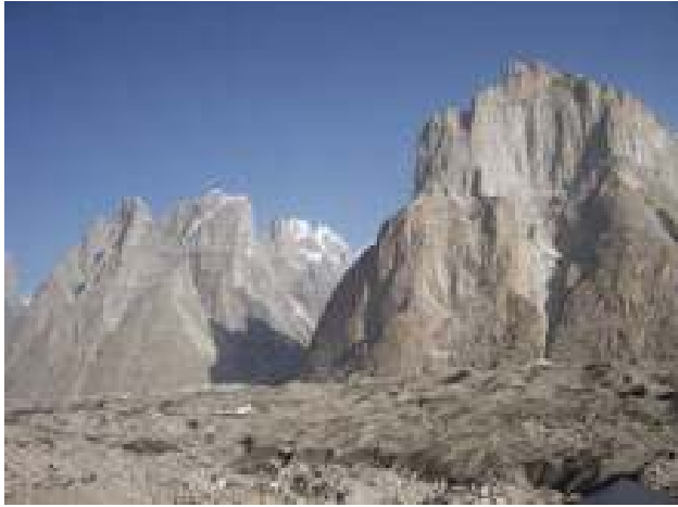
Trango Spires viewed from Urdukas