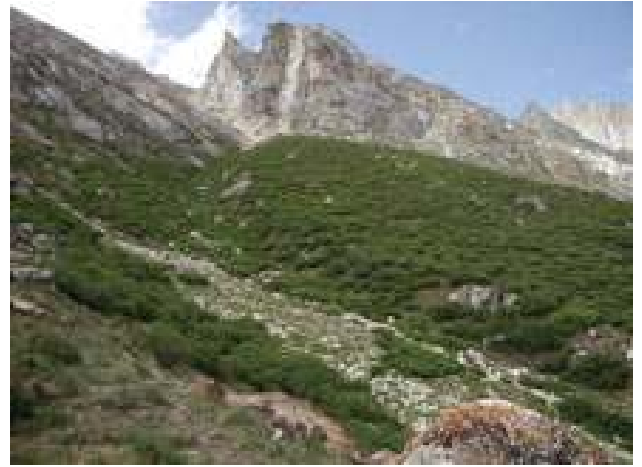
Grassy slopes behind Urdukas