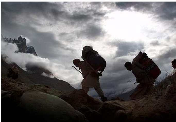
Porters walking on the Baltoro glacier

We will probably stop for lunch at the old campsite at Lilligo. After this break we cross below the snout of the Lilligo Glacier and then get back on to the Baltoro and walk up and down several moraine ridges before arriving at the Khoburtse campsite.