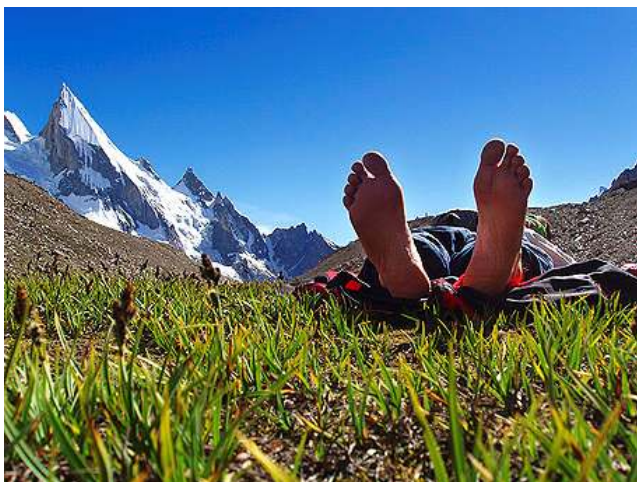
Relaxing at Khuspang with Leila peak behind

The Hushe side of the pass can be a tricky descent although there are fixed ropes in place at the top. The slope starts at a sustained 50 degrees on snow and finishes on loose scree towards the bottom. On reaching the green oasis of Khuspang, you can put your feet up and relax remembering the excitement of the day.