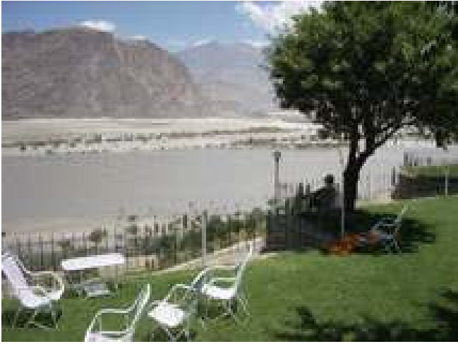
Beautiful gardens at K2 Motel overlooking Indus