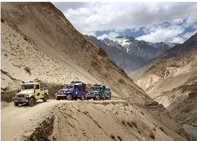
Jeep ride to Askole (Menno Boermans)

An exciting drive on a winding jeep trail in the arid landscape past villages with fertile terraces and apricot trees, Askole is the last village we will see for a few weeks. Overnight camping.