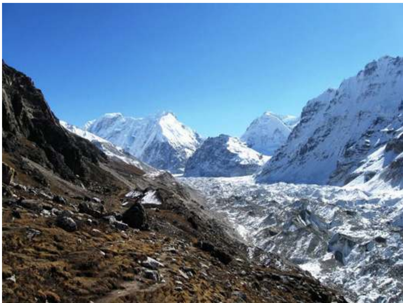
At Pangpema with views of Nepal and Tent Peaks