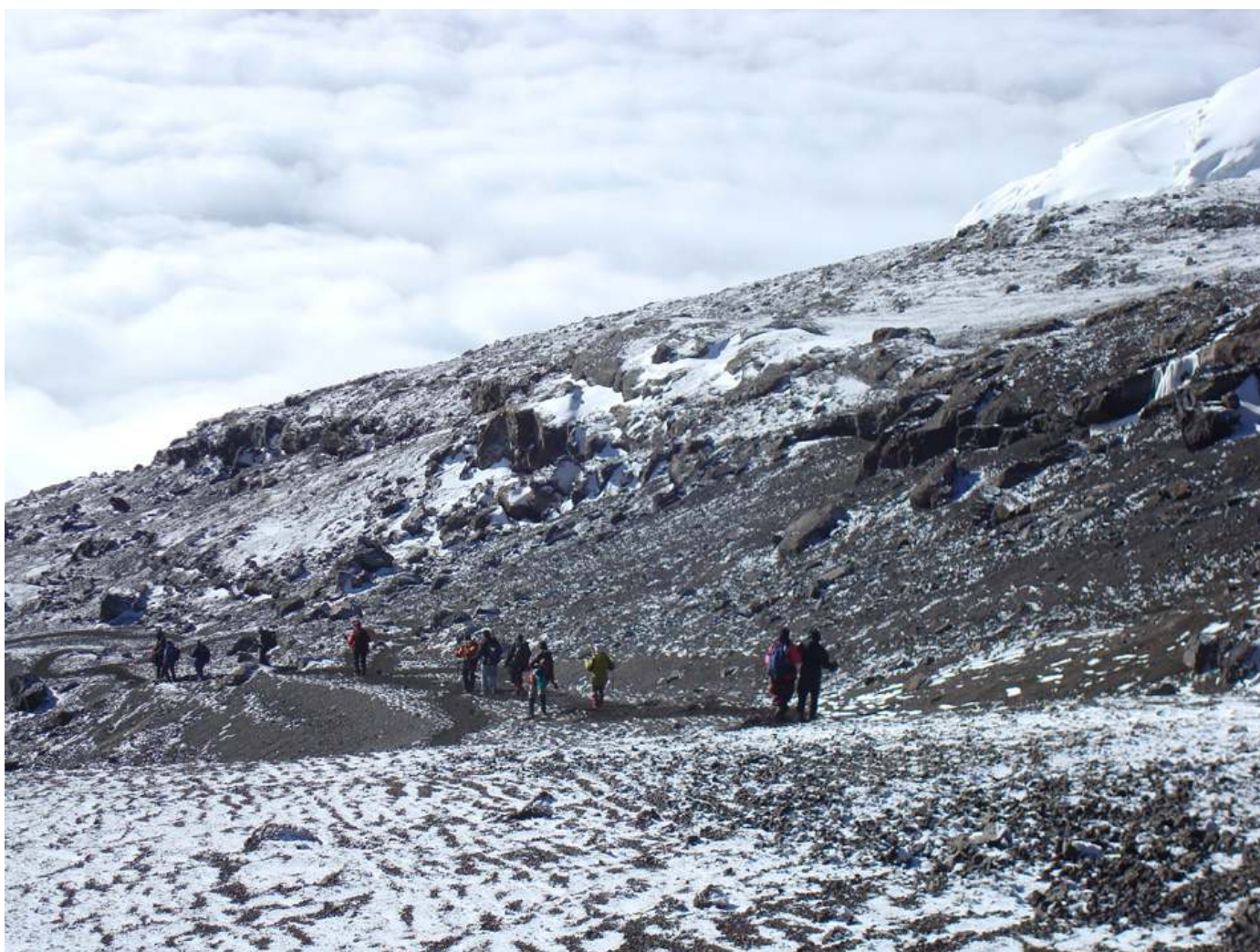
Descending from Stella Point (5,735m) on Lemosho route