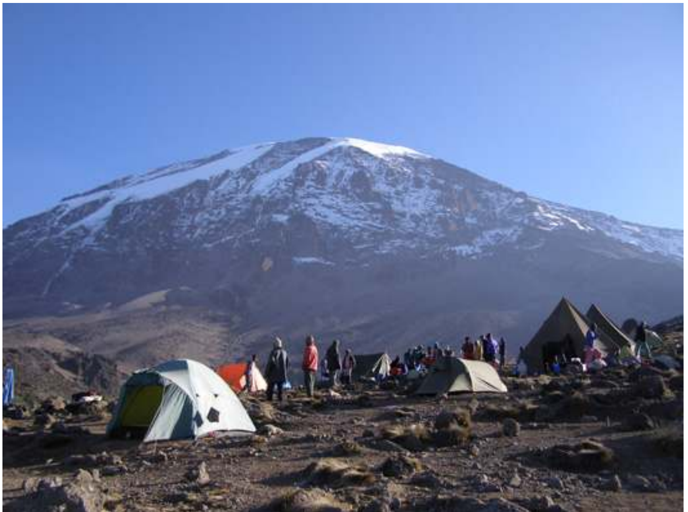
Mount Kilimanjaro as seen from Karanga Camp on Machame route