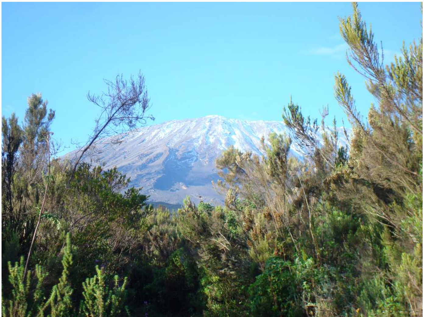
Summit of Kilimanjaro seen from Simba Camp on Rongai route