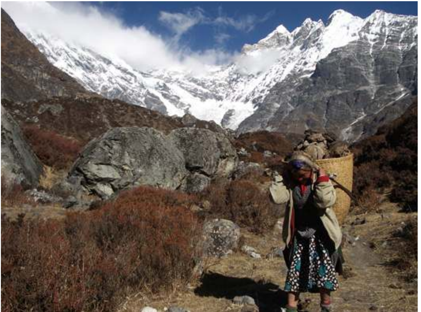
Sherpani lady in the Langtang valley