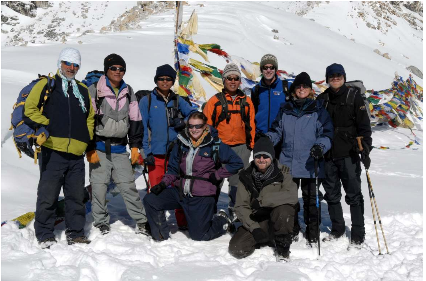
Group at Larkya La pass on the Manaslu Circuit