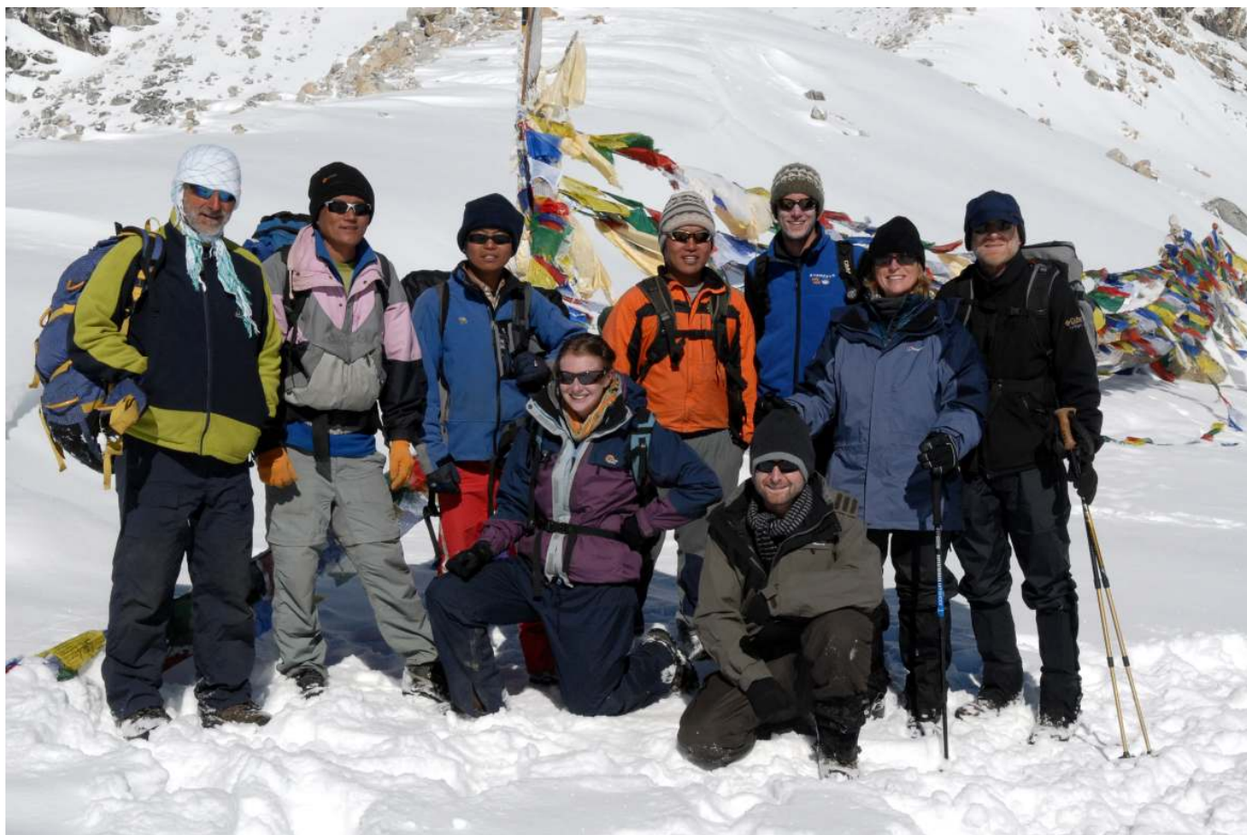
Group at Larkya La pass on the Manaslu Circuit