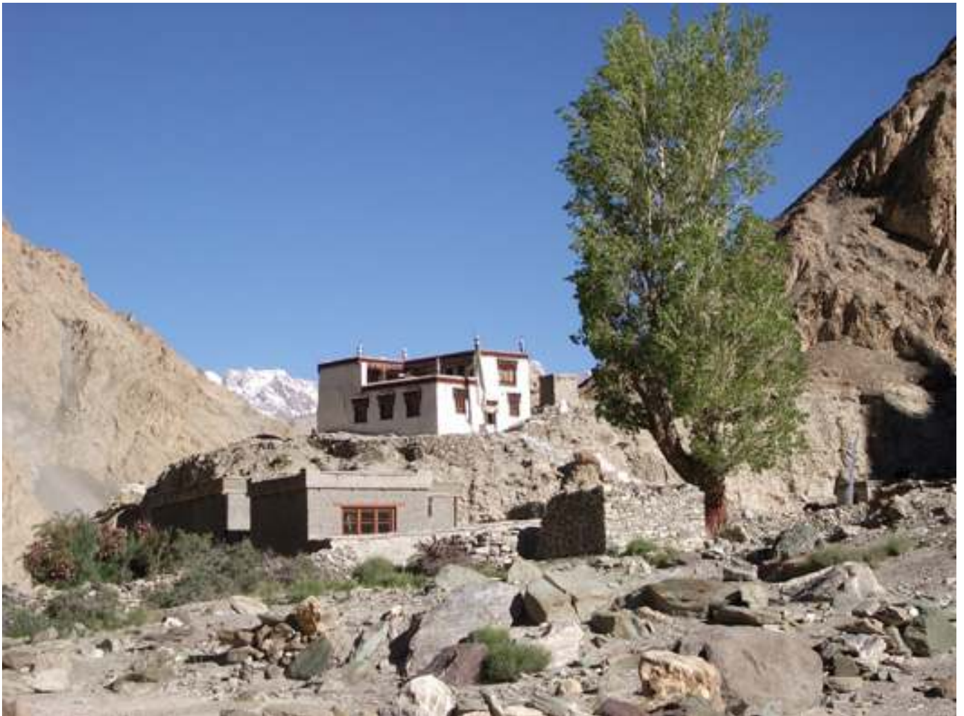
Markha Valley, Ladakh