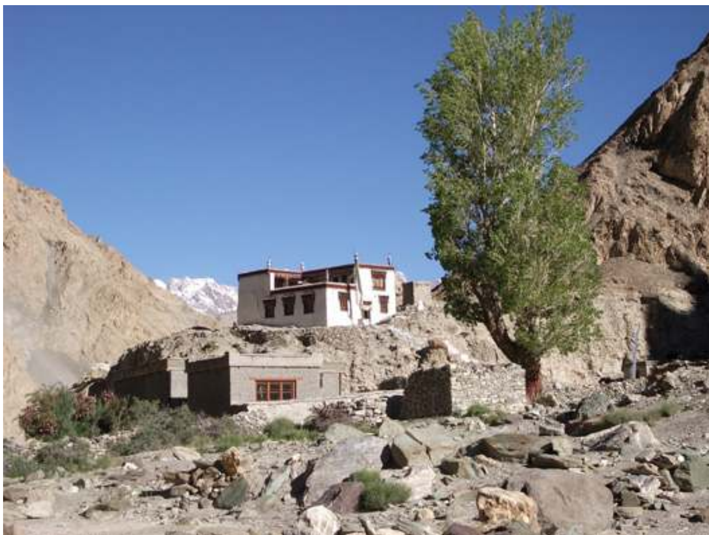
Markha Valley, Ladakh