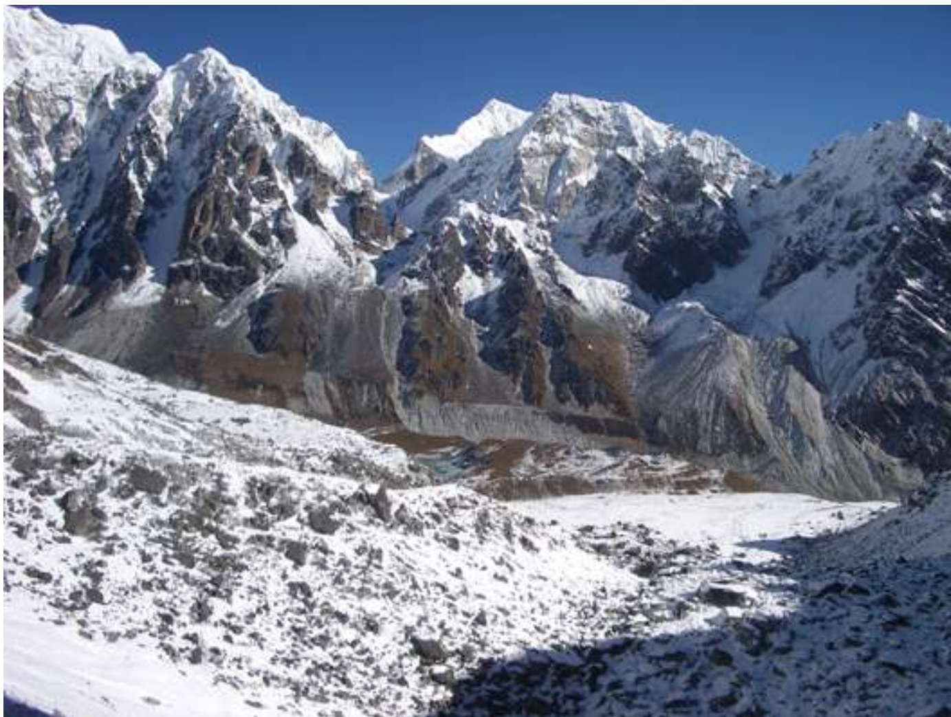
View from Goecha La