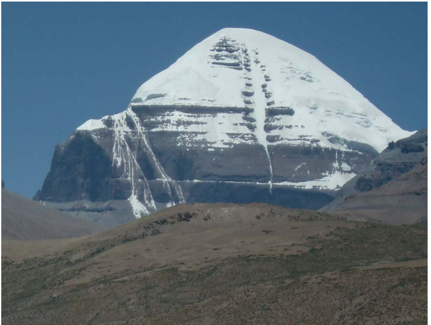
Mount Kailash in Tibet