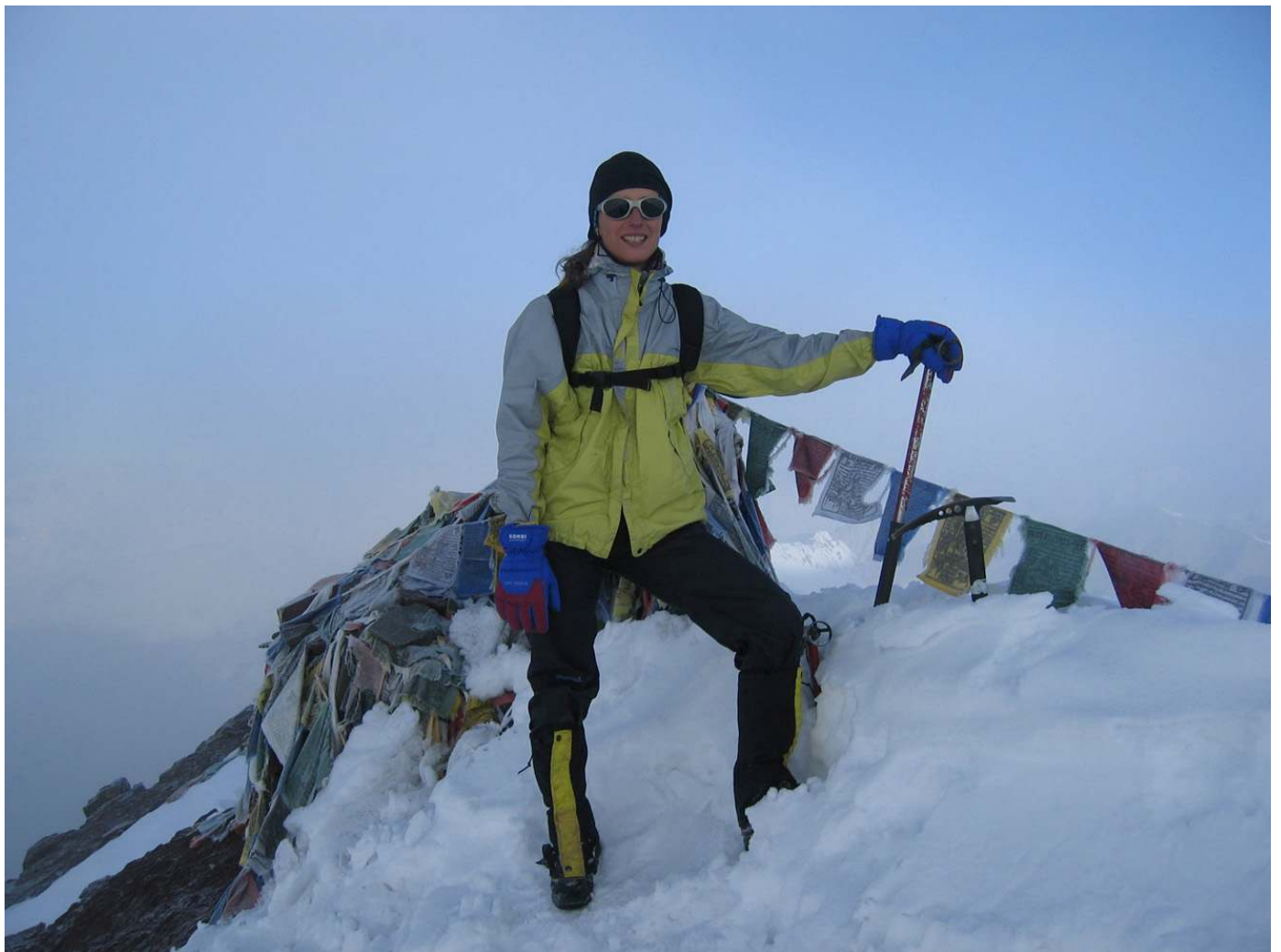
Summit of Stok Kangri