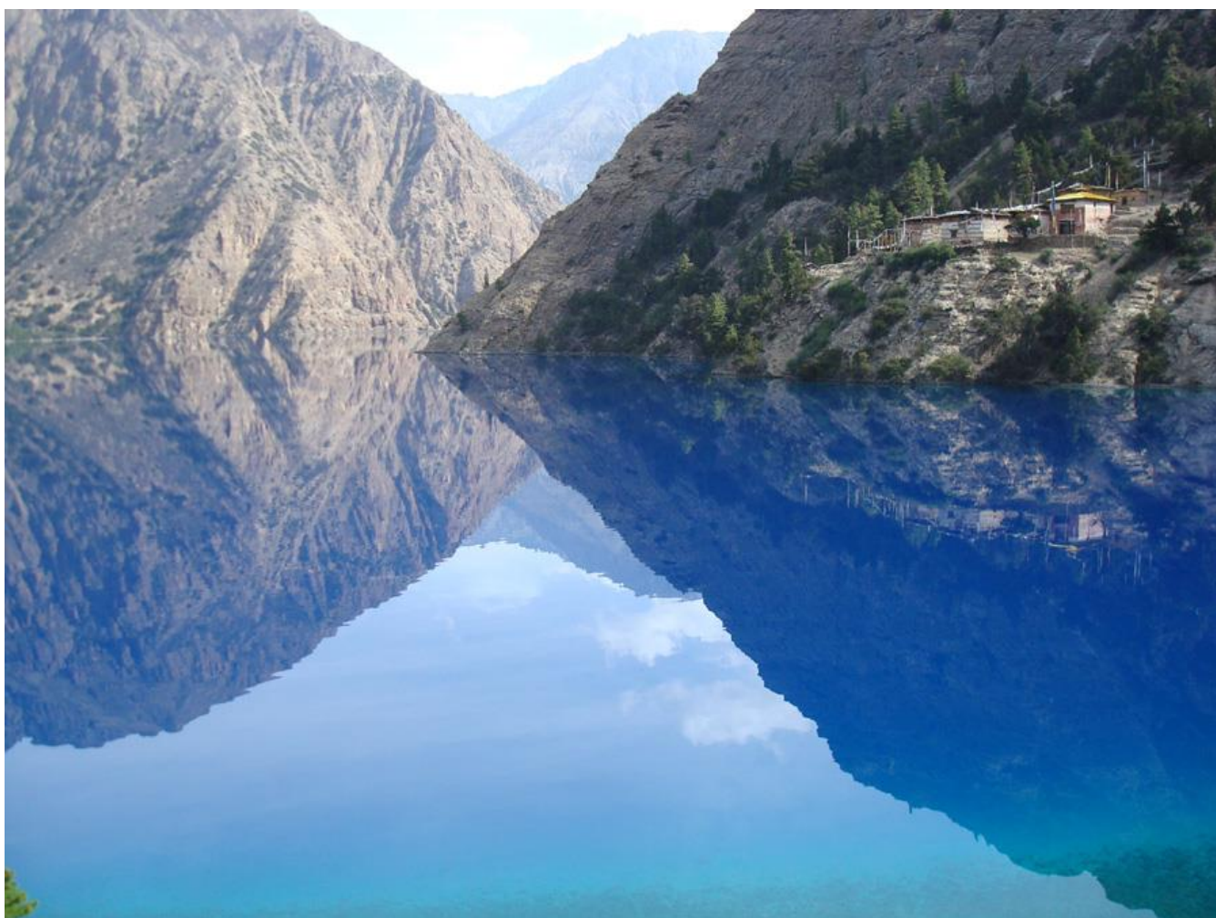
Bönpo gompa (monastery) overlooking Phoksumdo Lake, Dolpo