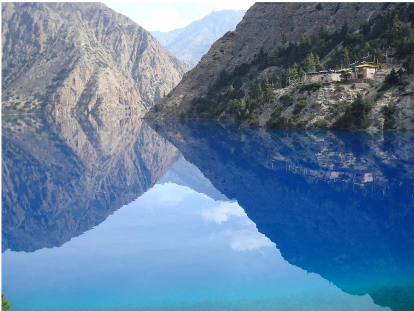
Bönpo gumpa (monastery) overlooking Phoksumdo Lake, Dolpo