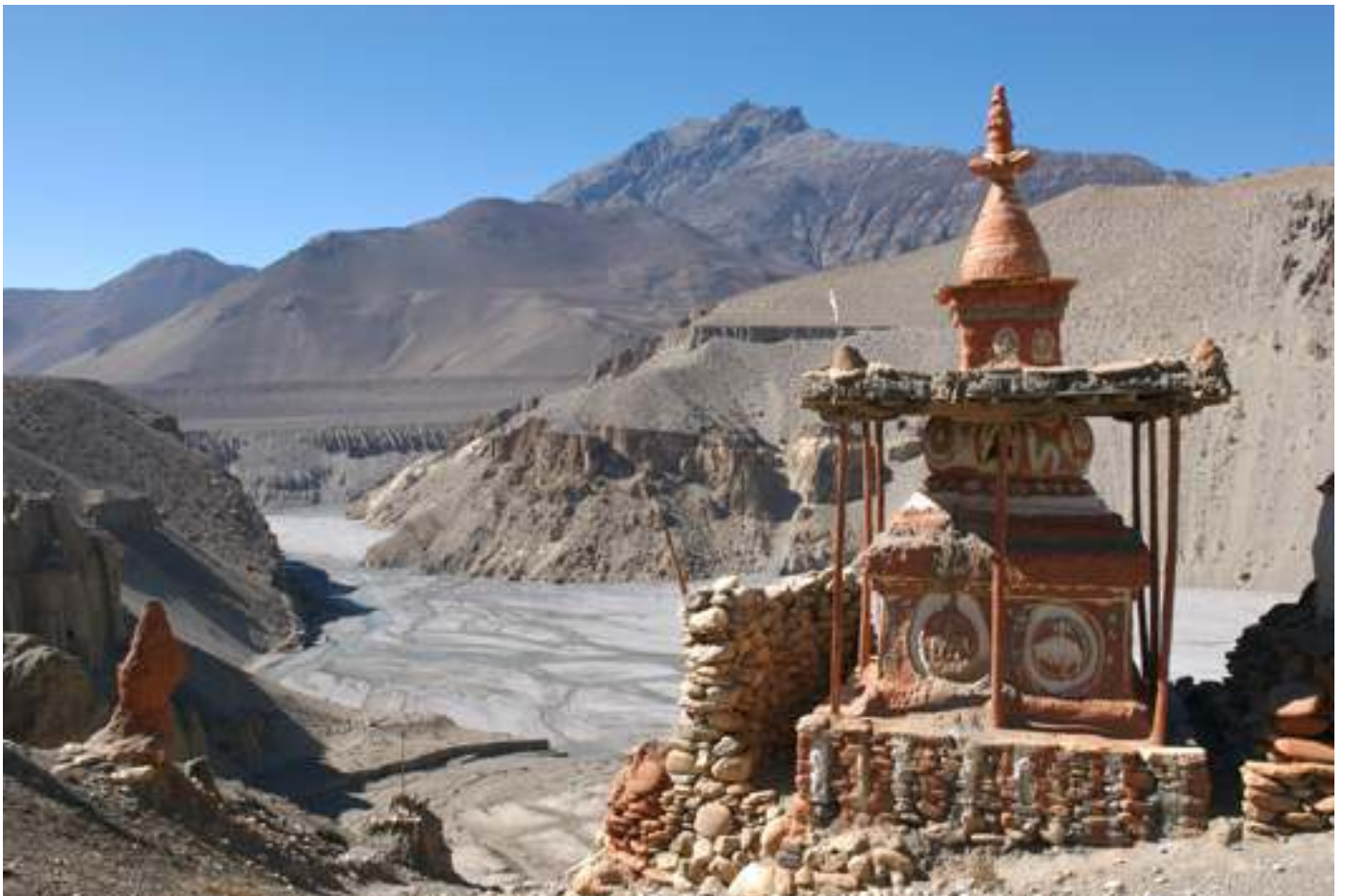
Buddhist chorten on the Upper Mustang trek