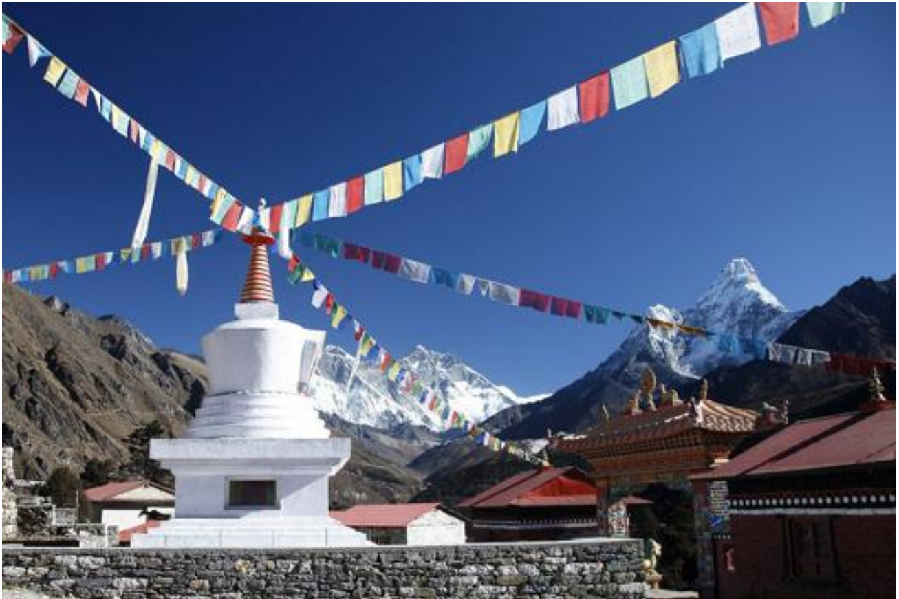
Stupa at Tengboche monastery with Mount Everest and Mount Ama Dablam