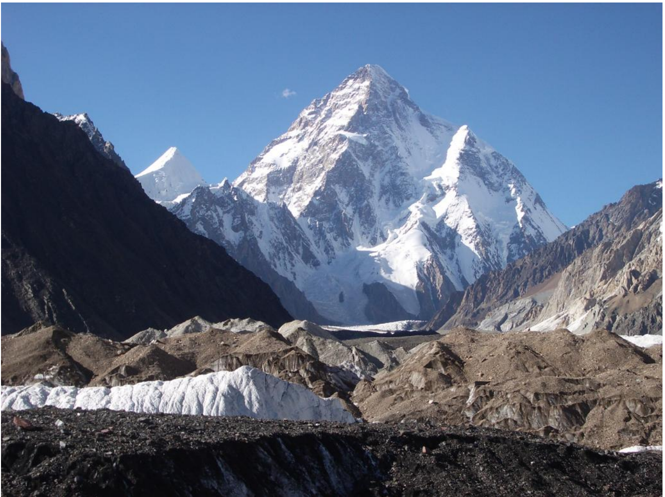
K2, the second highest mountain in the world