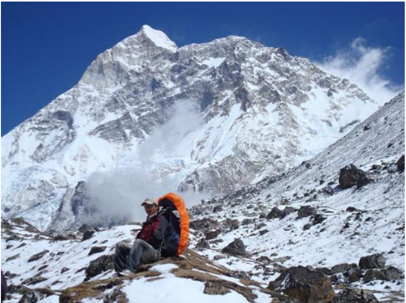
Mount Makalu as seen from near Base Camp