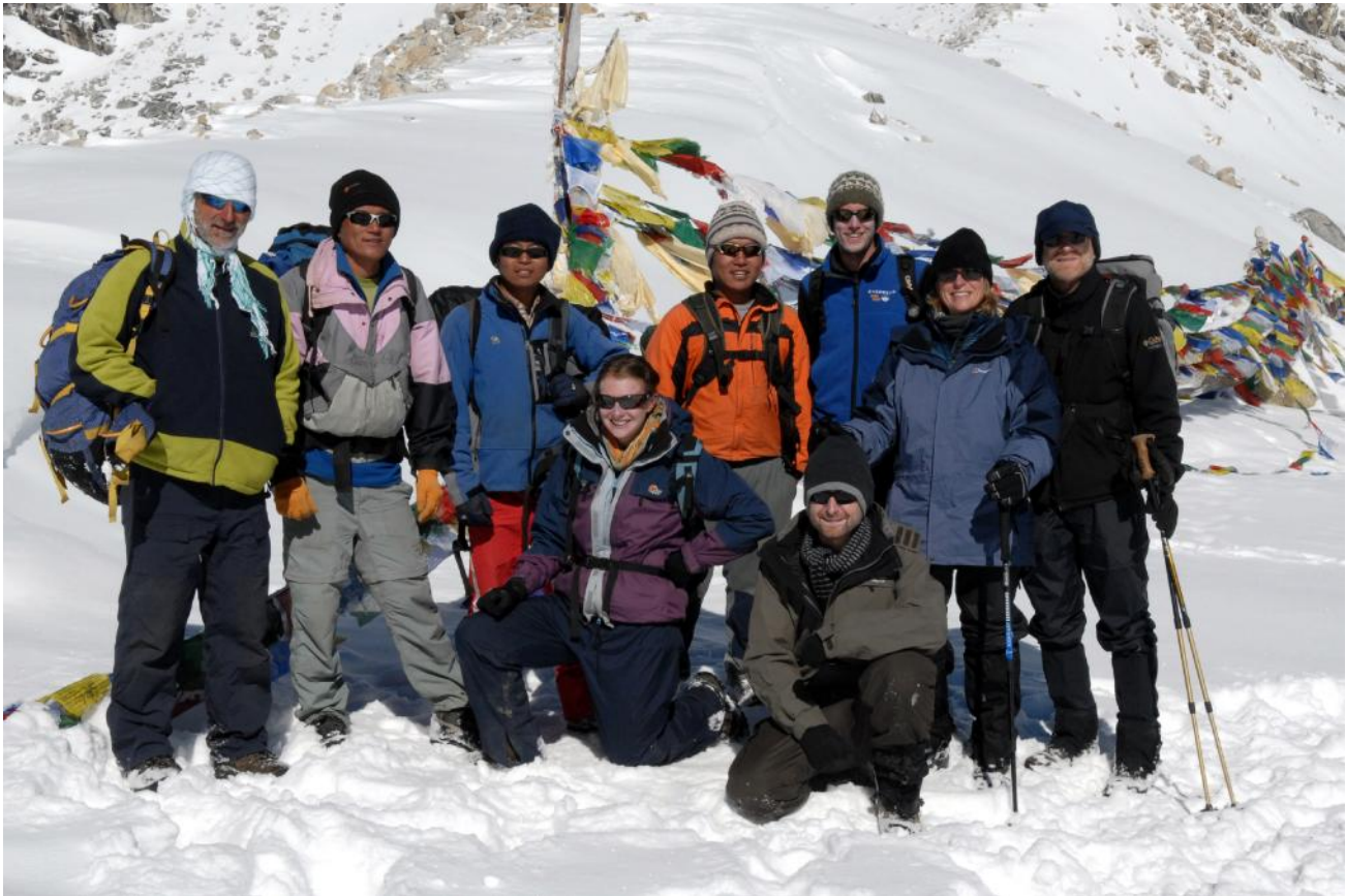
Group at Larkya La pass on the Manaslu Circuit