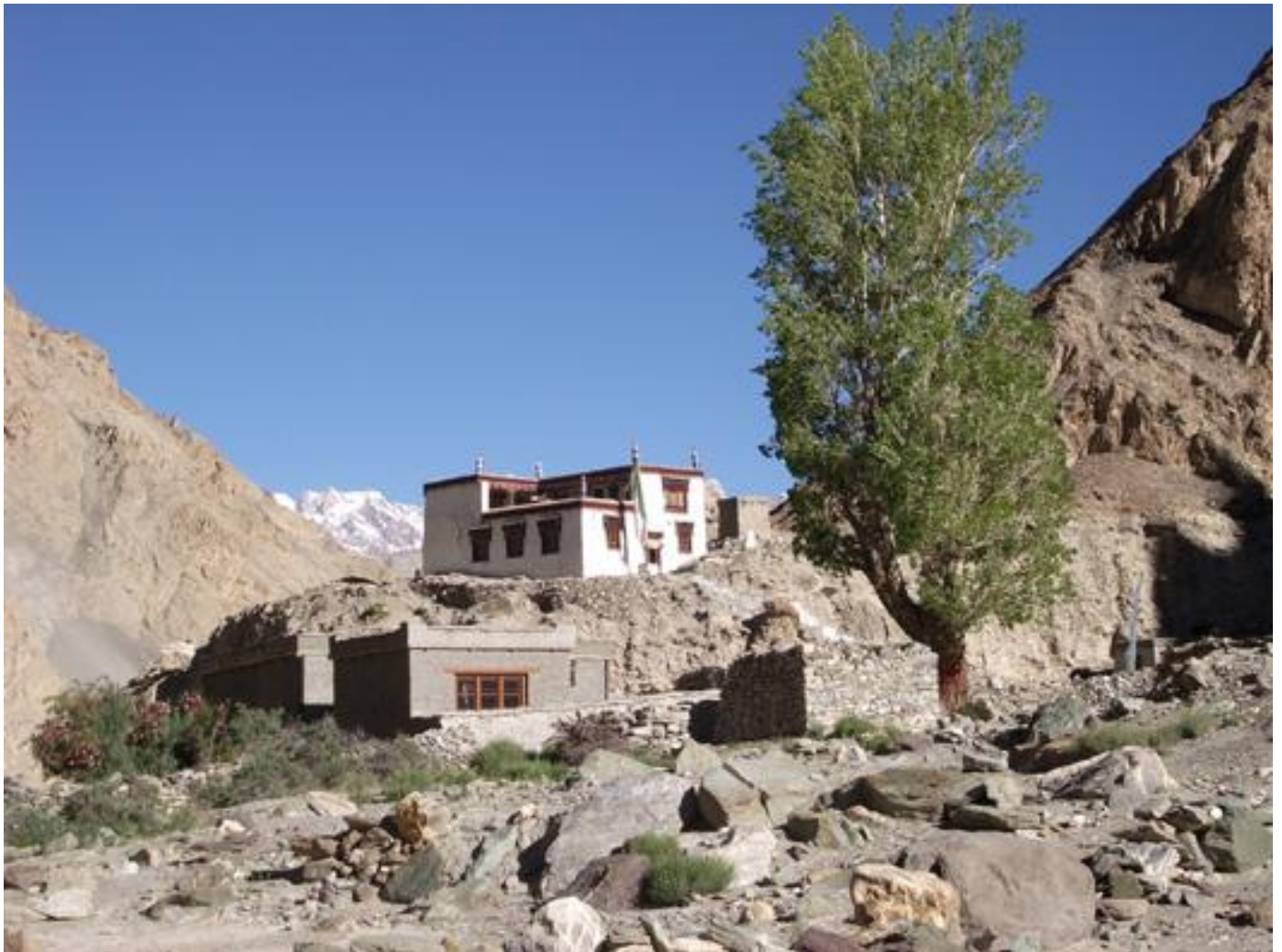
Markha Valley, Ladakh